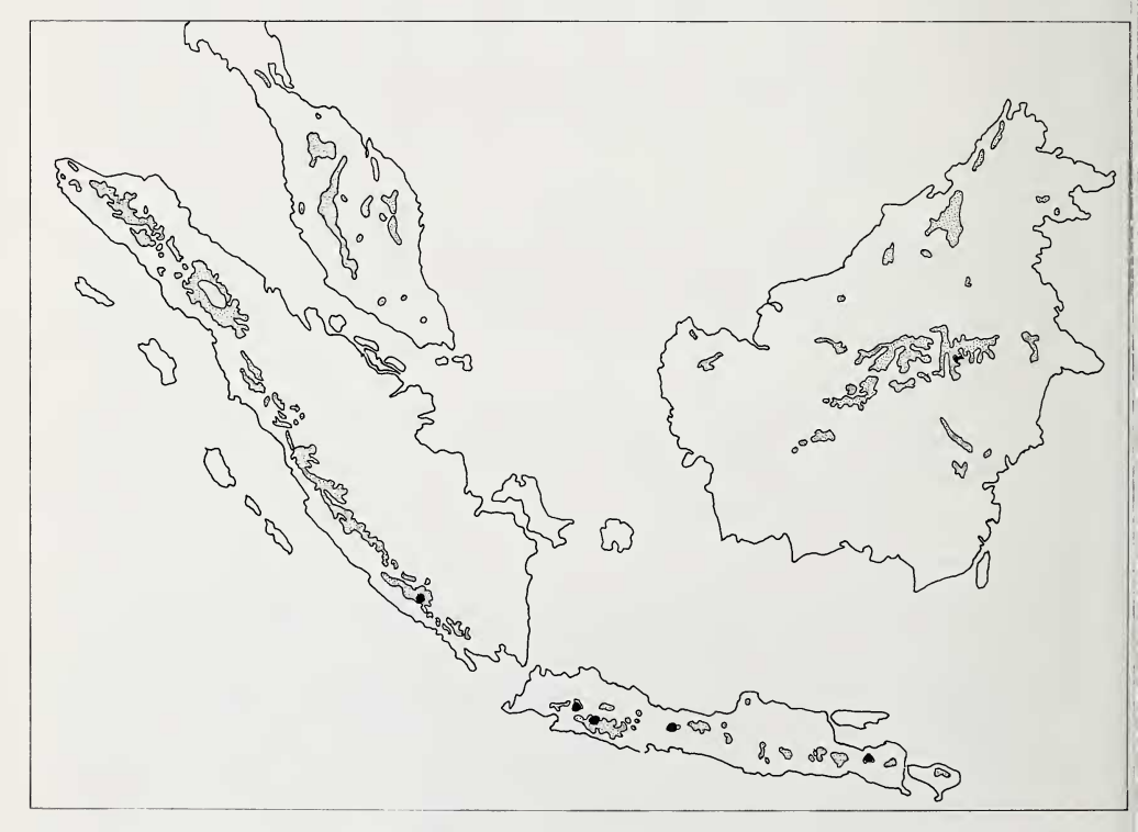
Fig. 1. Simplified map of Malacca and the western part of the Indo-Australian Archipelago showing the localities (dots) where Mustela lutreolina has been found. Stippled: areas above 1000 meter

While checking the material mentioned in the introduction and given in the list, one notes as one of most striking features the fact that all the mustelids, of which the localities are known, were collected in areas above 1000 m (see map). The locality Bencoolen or Benkoelen (now Bengkulu) (3°48' S, 102°15' E) is not in contradiction to this as in the last century this name was not only used for the town (at sea level) but also for the whole residence and for the mountainous region east and north of the town. It is therefore highly probable that the animal was collected at a high altitude. In relation to its occurrence at high altitudes, also the negative evidence, viz. that the species is not represented in the huge collection of mammals collected at the lowland areas of northern and eastern Java present in the British Museum (Natural History), is rather important. Nor is it present in the rather large collection of mammals from the lower parts of the former residence of Deli, northeastern Sumatra, present in the Zoological Museum in Amsterdam.